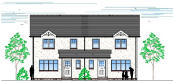
House Type D