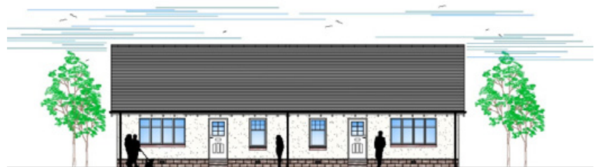
House Type B